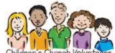
Children's Church Volunteers