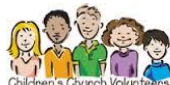
Children's Church Volunteers